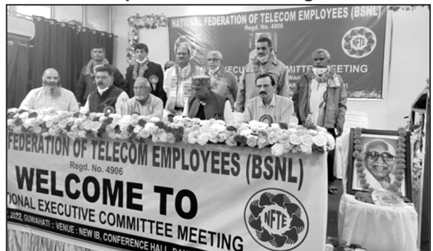
View of Dias