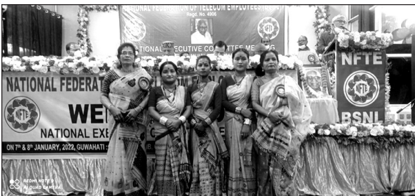
Women delegates of Assam circle