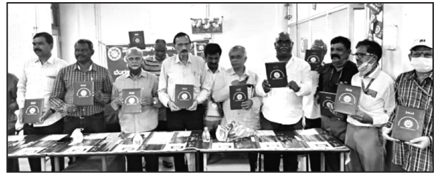
Dy. G.S. with retired NFTE member