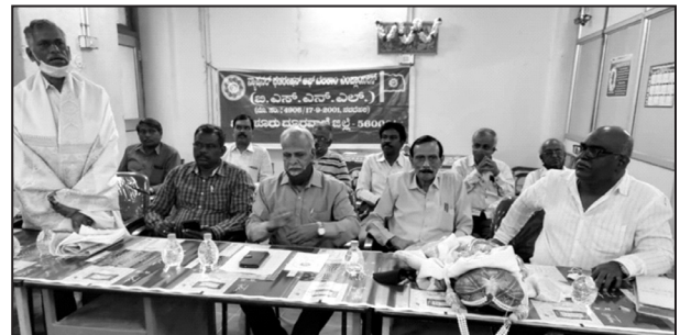
View of dias