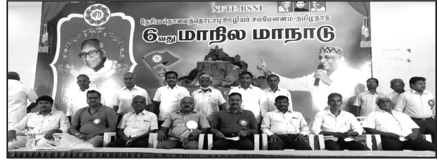
View of dias

Two days Circle Conference of Tamilnadu circle NFTE(BSNL) concluded with unanimous