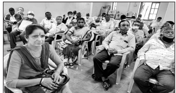
View of audience