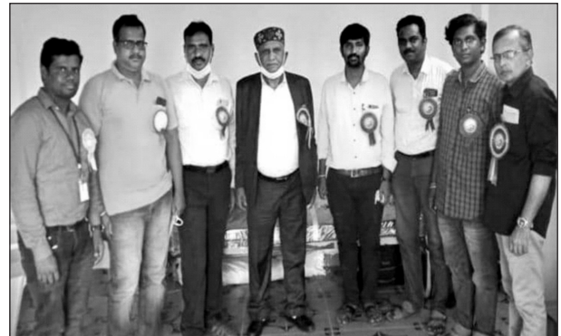
G.S. with Reception committee of TN circle