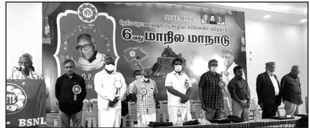
View of dias