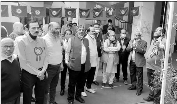
Flag hoisting ceremony at Guwahati

The meeting hall was decorated very nicely with flowers and the sitting arrangement was also with in the parameters of covid-19. Majority of CS's, All India office bearers and invitees attended the meeting. The Reception committee have honoured all the-guests with garland, Shwal, Hat and Gunny bag.