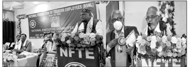
G.S. and president addressing the NEC