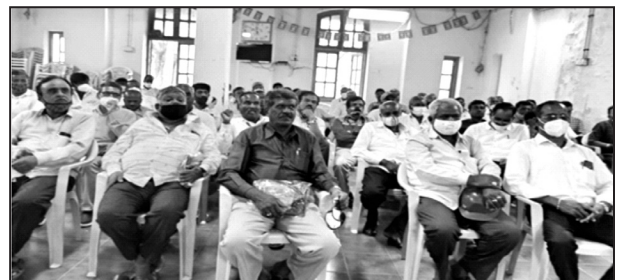
View of audience